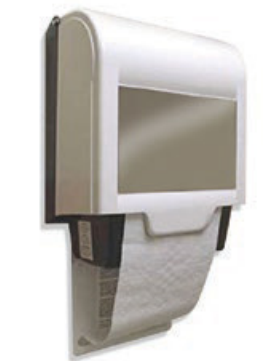
Continuous Roll Towel Dispenser

With over 700 SKUs, Berk International offers a full range of standard, custom and specialty wipes to a broad range of industry needs. Many wiping options are available in light, medium or heavy-duty substrates.