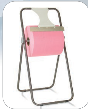
Jumbo Roll Floor Stand Dispenser