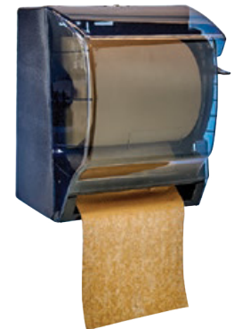
Hardwound Roll Towel Dispenser