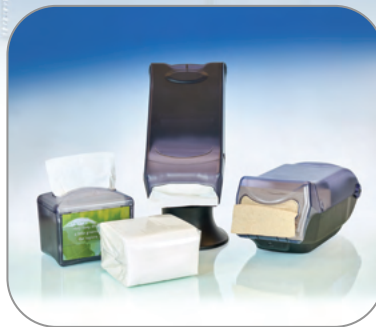
Dispense-A-Nap ® Dispensers

Our dispensers provide a clean, efficient way to manage tissue and towel use across any space. We offer variety of tabletop, floor, and wall-mounted options for both tissue and towel, designed to support hygiene, reduce waste, and fit seamlessly into professional and commercial environments.