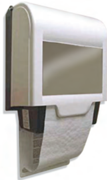
Continuous Roll Towel Dispenser