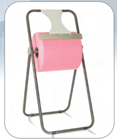
Jumbo Roll Floor Stand Dispenser

Contact your sales person for free samples and pricing 866-222-BERK Visit us at www.BerkInternational.com to view our complete line of wiping products