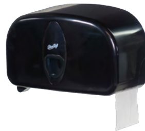
Eden Soft® Dual Dispenser